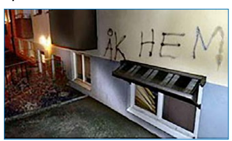
A Mosque in Mariestad vandalised by graffiti saying 'go home' in Swedish (El Mochantaf 2015)^{28}

Parallel to these damages are the attacks and incidents involving asylum housing. By October 2015, around 20 fire-related incidents, suspected to be arson by the po-